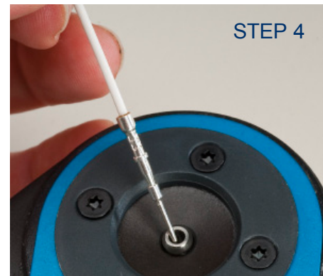
REMOVE TERMINATED WIRE ASSEMBLY