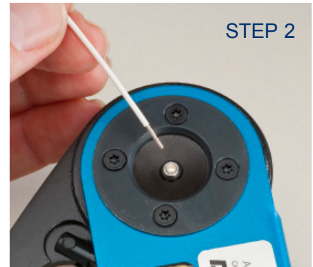
INSERT PRE-STRIPPED WIRE