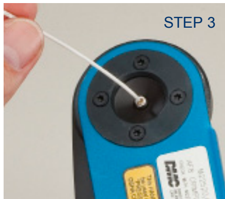
CLOSE / OPEN HANDLE