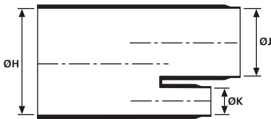
a: Expanded form (supplied)