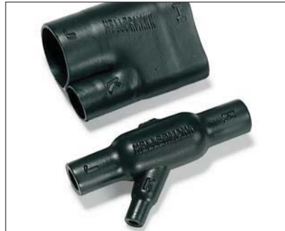
1303-1-G supplied / fully recovered.

This style provides strain relief, sealing and mechanical protection on cable harnesses. For VG shapes with portholes "P" please refer to product standards tables in the appendix.