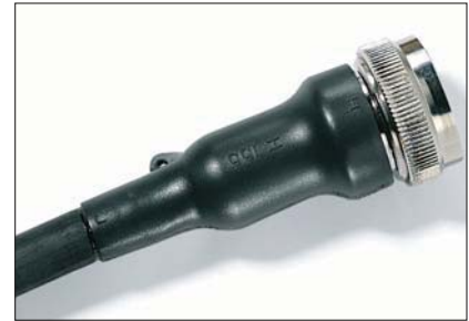
150 Series boot recovered onto a connector.