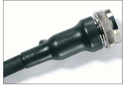
150 Series boot recovered onto a connector.