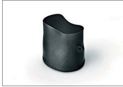
150 Series supplied.